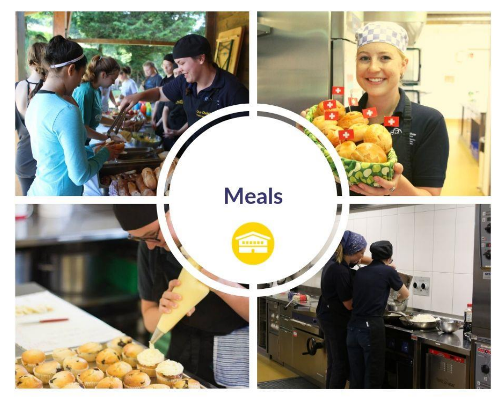
The following information applies to the indoor accommodation package only. Groups choosing the camping and Squirrel House packages must self-cater for all meals.

For groups booked on to the indoor accommodation package all meals from dinner on arrival day to packed lunch on departure day are included in the cost and provided by Our Chalet. The kitchen at Our Chalet is operated by the Kitchen Manager and a team of volunteer staff. We do our best to accommodate dietary requirements, however, if your group has a participant with a severe allergy or complex dietary requirement we recommend you discuss your needs prior to booking.